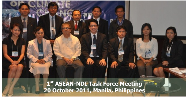
1 st ASEAN-NDI Task Force Meeting 20 October 2011, Manila, Philippines

The ASEAN-NDI Task Force (TF) was an ad hoc group composed of the ASEAN member state representatives who guided the development of the SBP. Several meetings, including videoconferences were conducted in relation to the SBP drafting and finalization.